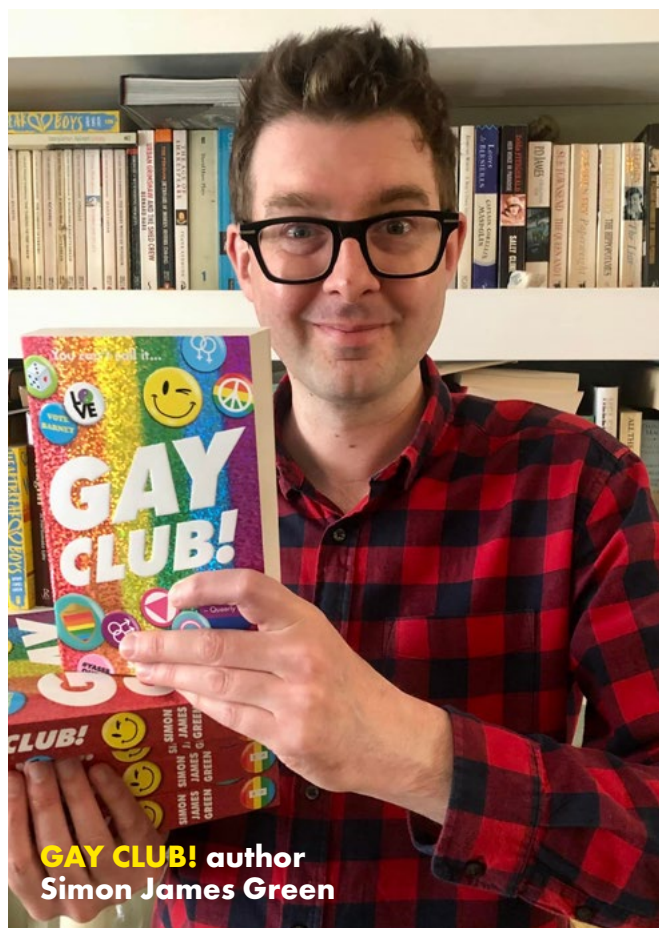
GAY CLUB! author Simon James Green

GAY CLUB! tells the story of the battle to become the president of Greenacre Academy's LGBTQ+ society with character Barney a shoo-in until voting is opened up to the whole school and chaos ensues as scandal, sleazy shenanigans and some serious shade comes thick and fast. GAY CLUB! is a manifesto for change, with a positive, comic, universal message at its heart.